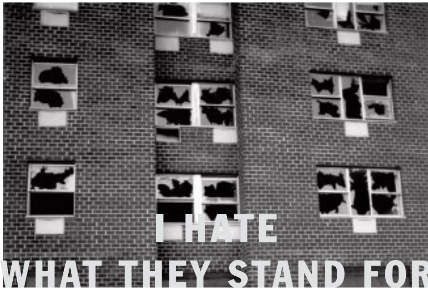
Gordon Matta-Clark, Window Blow-Out , 1976, the Bronx, New York

ART-SHIT IDIOCY , description by school porter of a work of art in the 8 th Swiss Sculpture Exhibition, Bienne, Switzerland, 1980.