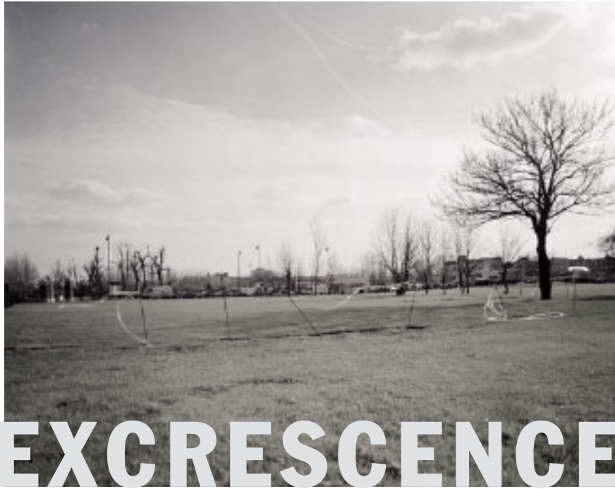
Site where House by Rachel Whiteread was located, Bethnal Green, London 1993