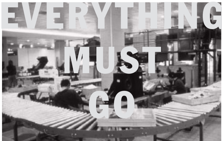
Michael Landy, Break Down , 2001, Former C&A store, Oxford Street, London