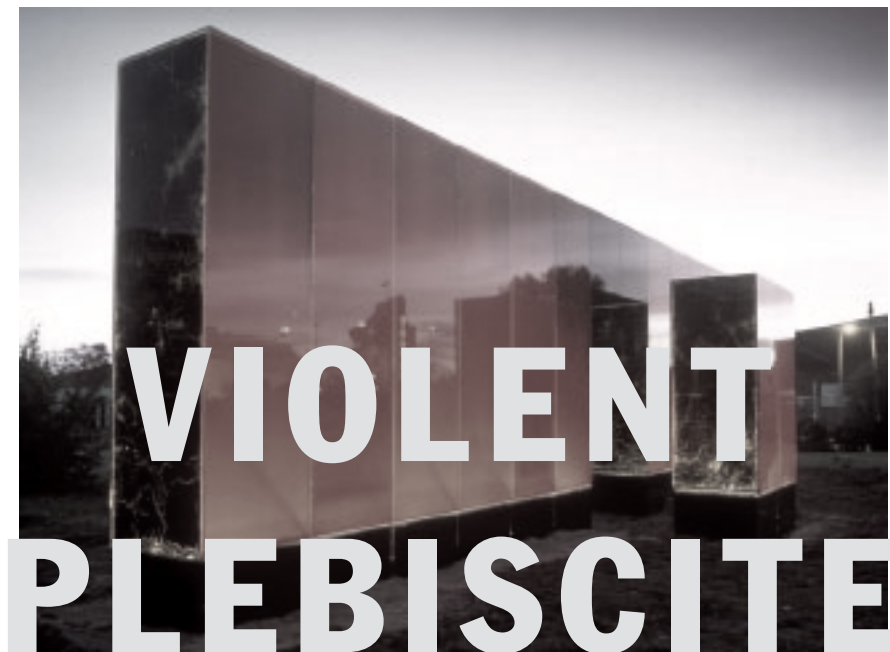
Vong Phaophanit, Ash and Silk Wall , 1993, Thames Barrier