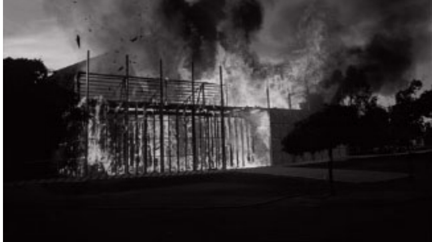
Alfredo Jaar, The Skoghall Konsthall , 2007, Sweden