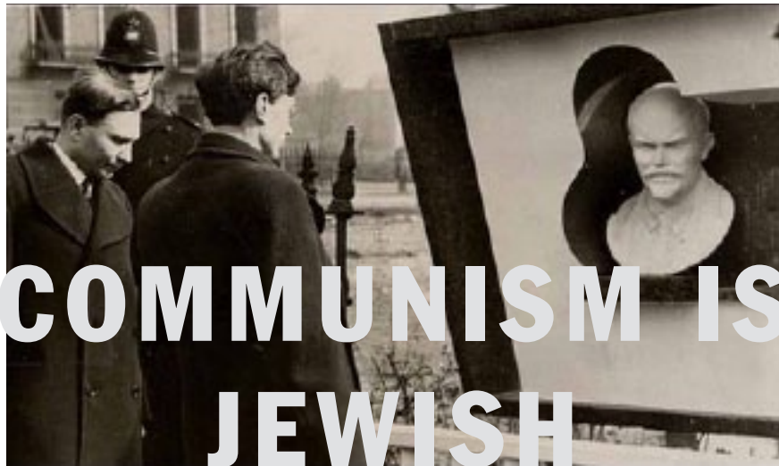
Lenin's bust by Lubetkin, 1942, Finsbury, London