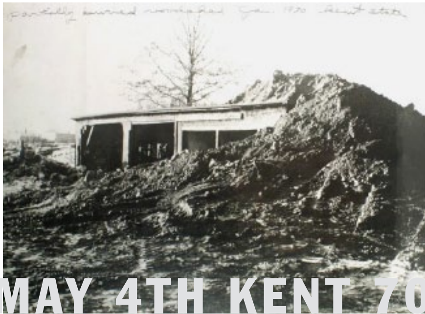
Robert Smithson, Partially Buried Woodshed , 1970, Kent State University, Ohio