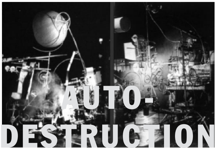
Jean Tinguely, Homage to New York , Museum of Modern Art, 1960, New York