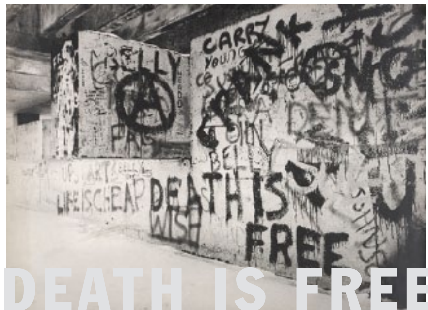
Victor Passmore, Apollo Pavilion , 1969, Peterlee, Durham